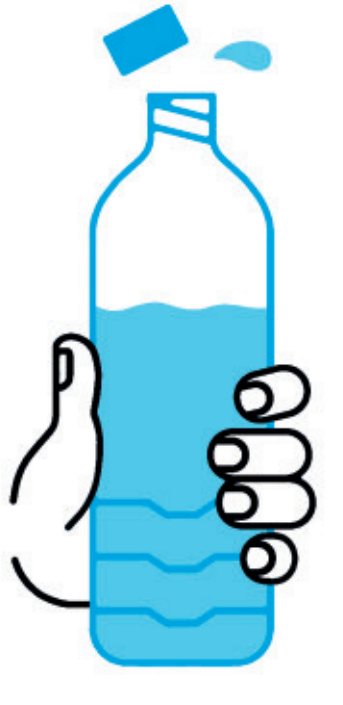
DRINK WATER REGULARLY

I f you see someone who is unwell, dial 15 .